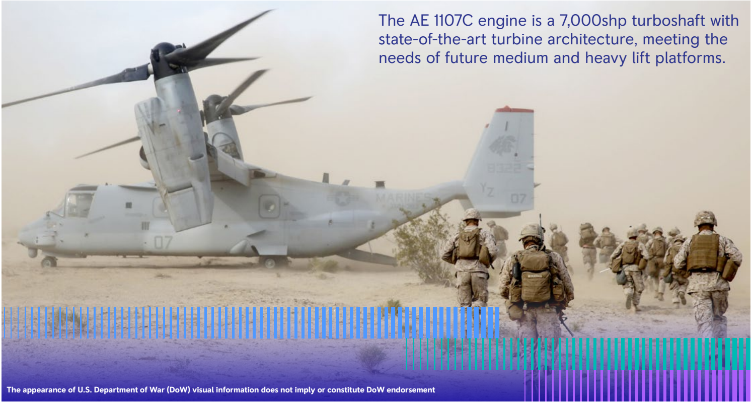
The appearance of U.S. Department of War (DoW) visual information does not imply or constitute DoW endorsement

The AE 1107C engine is a 7,000shp turboshaft with state-of-the-art turbine architecture, meeting the needs of future medium and heavy lift platforms.