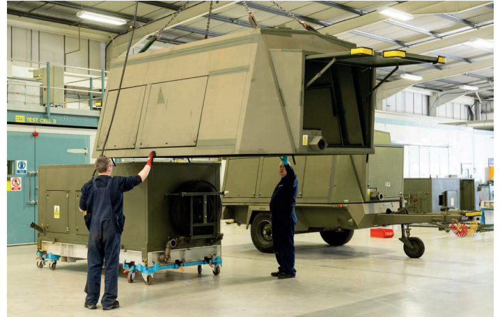
Generator maintenance at the Winsford facility

Example: Rolls-Royce DGS were the original equipment manufacturer for the Auxillary Power Unit (APU) installed on the Titan/Trojan vehicle. We also provided repair coverage for the full overhaul of the equipment.