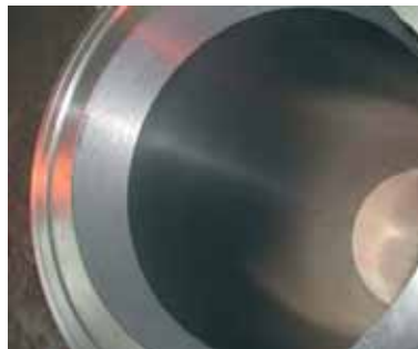
Modified detail in combustion chamber, reduces potential of carbon fouling the piston crown thereby reducing lube oil consumption

It allows the deposits to build up in the upper area of the combustion chamber first, before they affect the