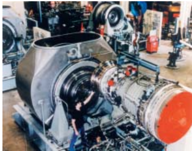
RB211 generating set assembly

The generating set is supported by a maintenance agreement to ensure that the unit continues to operate at optimum performance throughout its life. Rolls-Royce engineers work closely with the other major equipment suppliers to ensure that system outages are carefully planned and reduced to the minimum time possible.